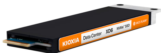
XD6 Series – 9.5mm 6

The KIOXIA XD6 Series E1.S SSDs 5 include: