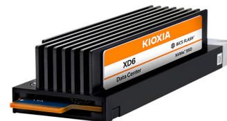
XD6 Series – 25mm