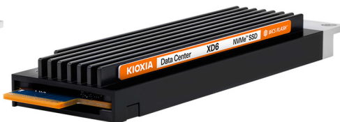
XD6 Series – 15mm