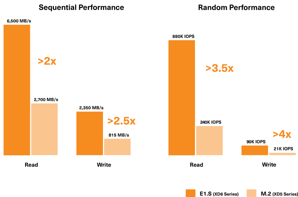
Figure 1: XD6 Series (E1.S SSD) vs XD5 Series (M.2 SSD) performance comparisons

Designed for consistent performance, latency and reliability in 24x7 cloud data centers, the XD6 Series delivers 4x greater improvement in random write performance, 3.5x greater improvement in random read performance, 2.5x greater improvement in sequential write performance and 2x greater improvement in sequential read performance when compared to the previous XD5 Series generation (M.2 format). The XD6 Series utilizes a purpose-built controller with the latest PCIe 4.0 interface enabling sequential read bandwidth to saturate the PCIe 4.0 bus, transferring data at speeds up to 6,500 megabytes per second 1 (MB/s) (Figure 1).