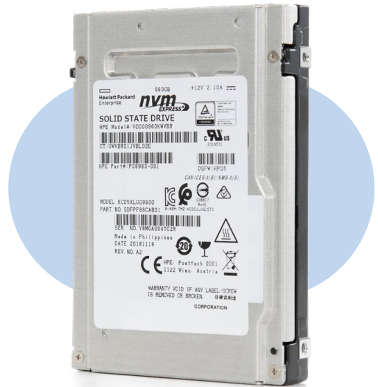
KIOXIA NVMe mainstream SSD

SATA-IO, the organization governing SATA technology, says it has no plans to improve the interface's bandwidth, whereas SAS and NVMe technologies have roadmaps for their respective standards that suggest more improvements over time. The SCSI Trade Association published a roadmap in 2019 that shows the availability of 12Gb/s SAS through at least 2021, with 24G SAS rolling out to end-user products in 2020. 5 Similarly, the NVM Express® Promoter Group released a new version of the NVMe base specification earlier this year that adds significant functionality that drive manufacturers will soon implement in new SSDs. 6 The NVMe organization also has over 50 ongoing projects in their technical working groups with over 130 companies working on them. 7